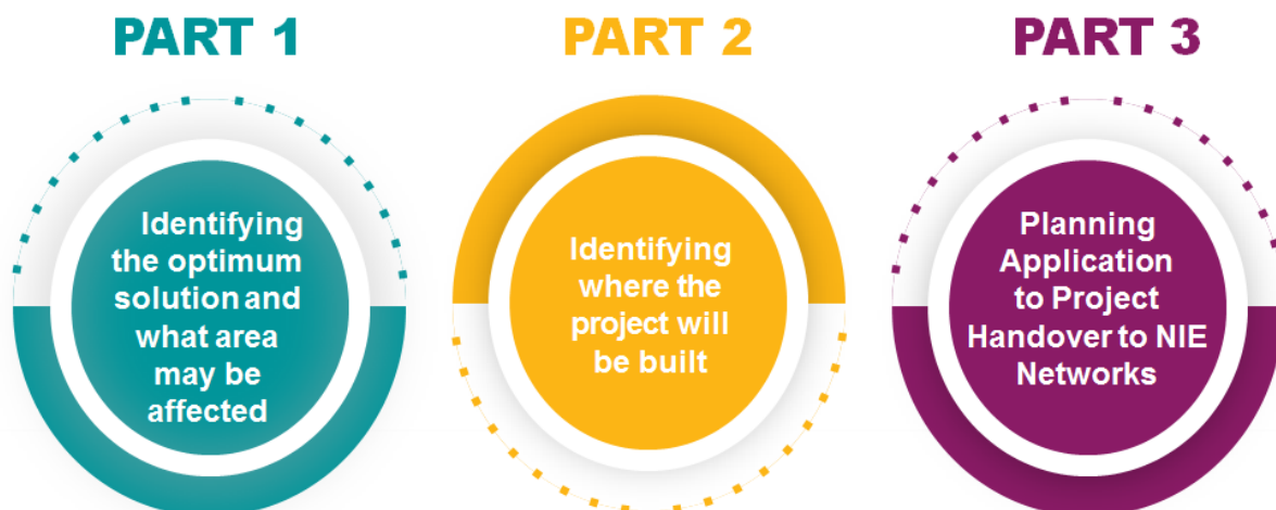
Figure 2.1: SONI's Grid Development Process

The planning of grid development projects by SONI is done under a three part process (Figure 3.1). Asset replacement projects are progressed separately by NIE Networks. The process includes for stakeholder and public participation in the development of projects.