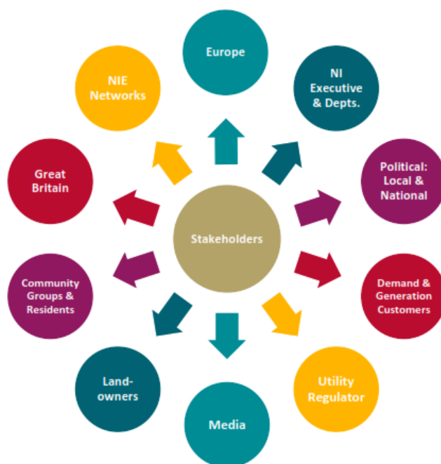
Figure 1: SONI Stakeholders

Figure 1 below shows the variety of stakeholders which we engage with.