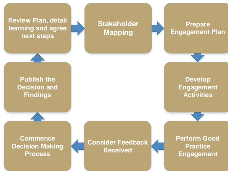
Figure 4: SONI Stakeholder Engagement Process

Our key engagement principles ensure that we will listen to all our stakeholders and consider their feedback to ensure better outcomes in our decision making. We want to ensure that our stakeholders will have their say and that we are listening.