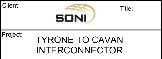
FIGURE 1.2: ADDITIONAL VISUAL RECEPTOR LOCATIONS DETAILED 500m STUDY AREA TOWERS 33-39 (SHEET 7 of 21)

This material is based upon Crown Copyright and is reproduced with the permission of Land & Property Services under delegated authority from the Controller of Her Majesty's Stationery Office, © Crown Copyright & database rights FLA213. Unauthorised reproduction infringes © Crown Copyright and may lead to prosecution or civil proceedings