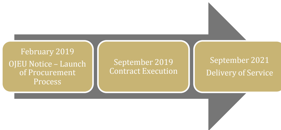
Figure 1: DS3 Volume Capped Procurement Timelines